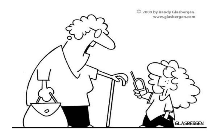
"Wireless communication is nothing new. I've been praying for 75 years!"

xtra copies of the November meeting minutes of the St. Pius X Parish Council are available in the church gathering space.