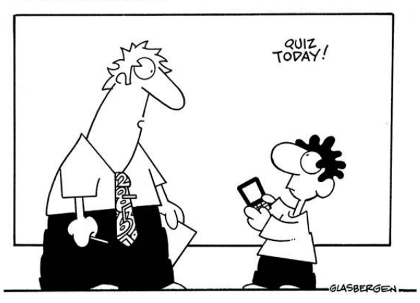
"You have to attend classes. You can't just follow me on Twitter."